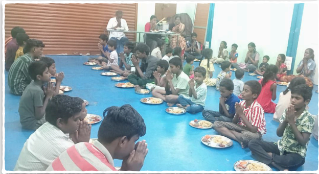
Helping Hearts (Children orphanage)