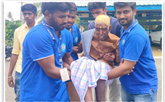
Atchayam Foundation (Beggar rehabilitation centre)