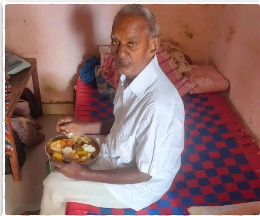
Neri Foundation (Old age orphanage)