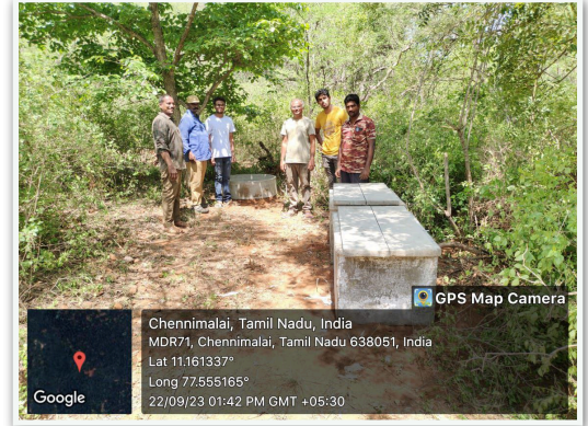
Animal care (Water for animal)