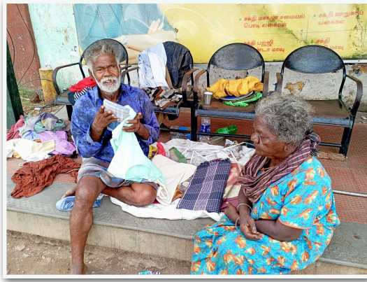
People on street (Living in street)