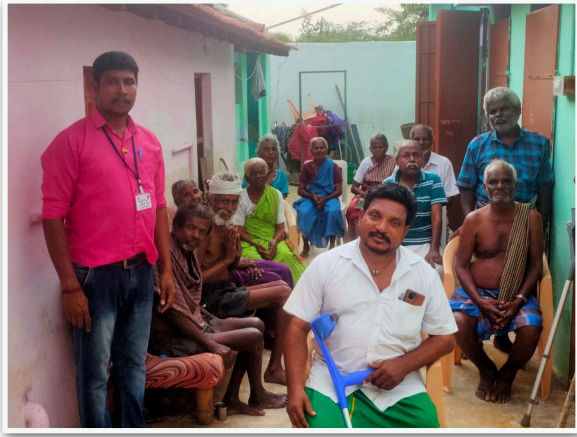
Neri Foundation (Old age orphanage)