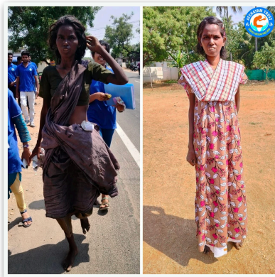
Atchayam Foundation (Beggar rehabilitation centre)