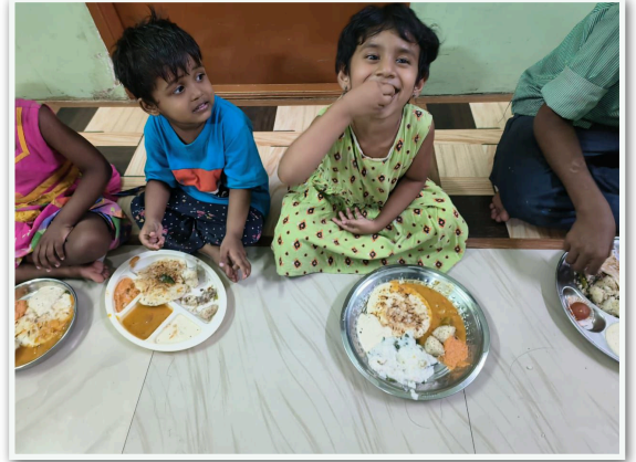
Helping Hearts (Children orphanage)