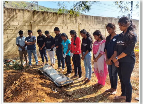
Uravugal Trust (Burial - Final Rites)